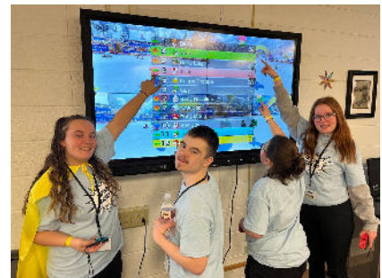
Esports: Make It Unified

Of the many great aspects of being a part of a Unified Champion School is the ability and desire to allow students to make it their own. We LOVE hearing about the many different Unified Clubs throughout the state!