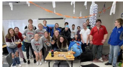
Unified Clubs...Creativity is Essential

As a leader in the unified movement, we encourage as many staff members in your school(s) to take the FREE "Coaching Unified Sports" training course thru NFHS. Coaching Unified Sports Course (nfhslearn.com)