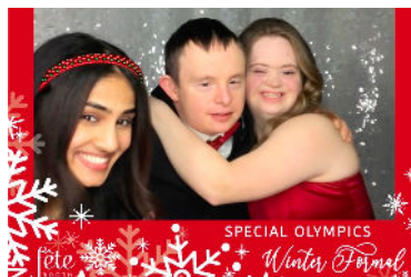
Saint Louis University's Special Olympics Club hosted a Winter Ball for 80 Local Athletes