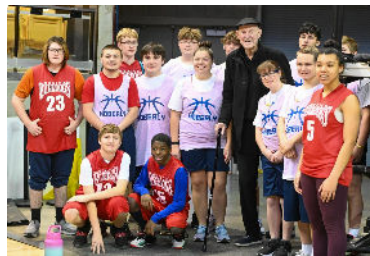
Mexico and Moberly Competed at the Norm Stewart Classic