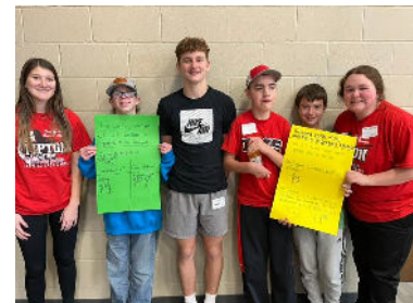
Tipton Students Worked on Unified Sports and Inclusive Youth Leadership using the IYL Facilitators Guide