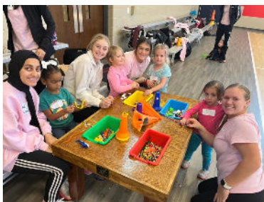
Fulton High School Student Council (#MASC) executed another successful Young Athletes Program