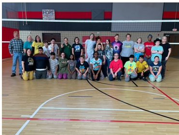
Missouri School for the Deaf visited the Training For Life Campus